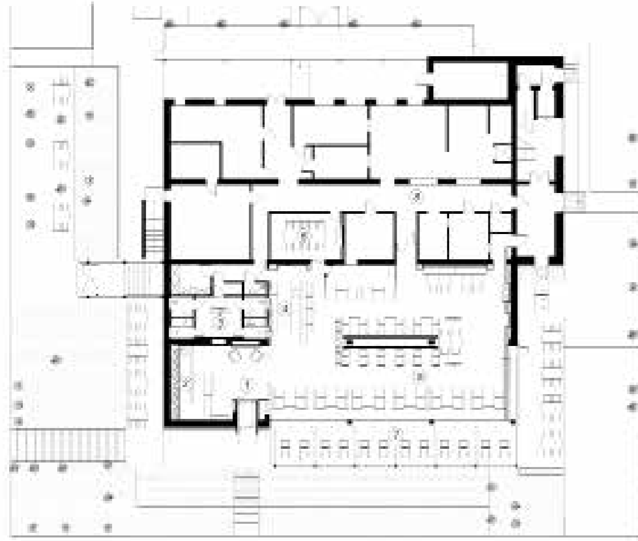
Food & Forest Restaurant Plan

The restaurant is located on the ground floor of a freestanding building (a conference hall is located on the first floor). Functional zoning of engineering spaces of the restaurant is accomplished with account for all high technology peculiarities of the production processes.