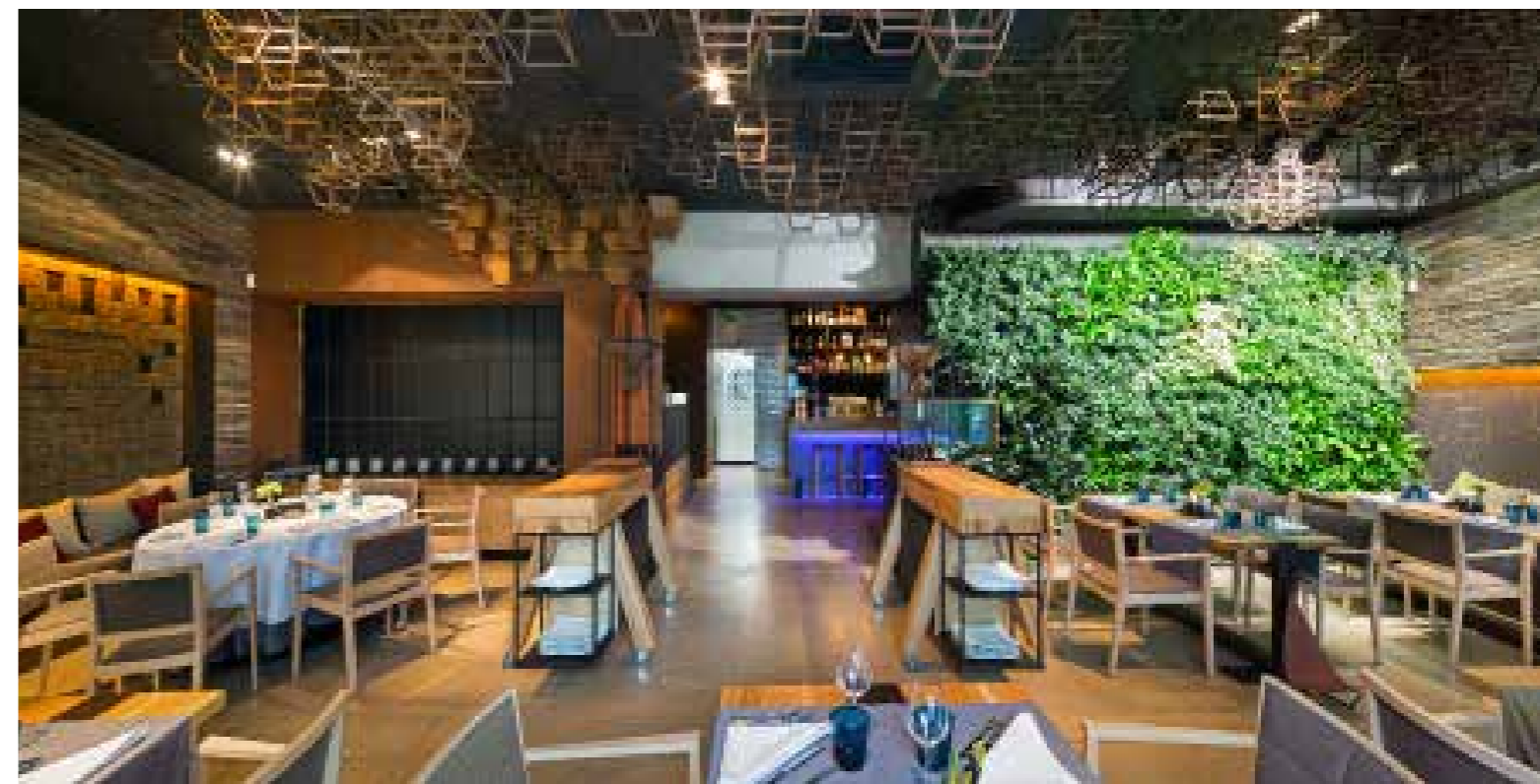
Fish & Fusion Plan

The metal in the aqueous environment is resistant to corrosion (rusting) and this way becomes brighter and more interesting, like it is alive. This material was actively used by us in the decoration of walls and in the decorative items making.