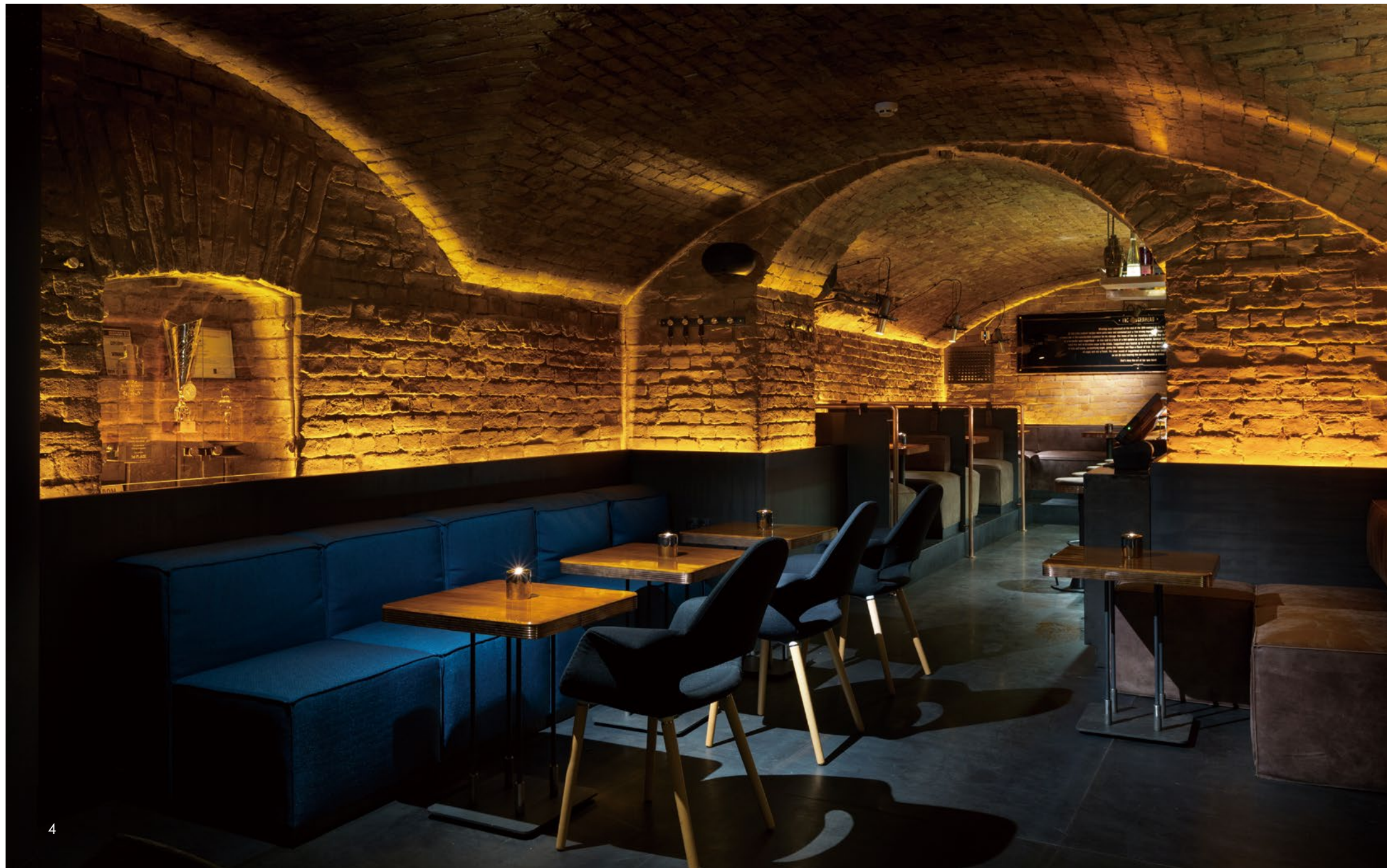
4/ Seating area 5/ Restroom